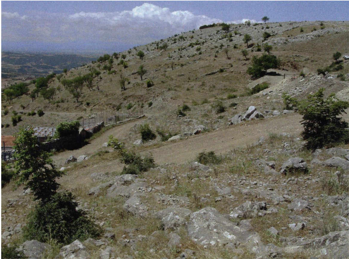
Figure 3 - The road on the left leads to the fountain of Tsipoutoura and "Alki's Pit". On the right, the top of the hill of Sykia.

In the morning of the next day, March 5 th , the Italian battalion departed from the places where it had spent the night, crossed the bridge of Aliakmon and within an hour had reached a mostly lowland area, which bore the name "Fardykambos". In this area the Italian force gathered, and after the battalion had rested, at noon, they were ready for the excursion to Siatista. Indeed, the Italians, after a rest of 2 hours, began the attack with a force of 2 companies in the early afternoon. One company headed towards the lower district of Siatista (Geraneia) following an uphill and inaccessible gorge (aka "Alki's Pit" 6 ) that finally led passing through the fountain of Tsipoutoura - to the hill of Sykia, where today is the chapel of St. Theodore. A second company deployed further west followed a ravine which eventually led to the mahala of Bounos, the upper district of Siatista (Chora), leaving on the right the hill of St. Christoforos where the rebels led by reserve lieutenant Kostas Bentas were hiding. A third company remained at the battalion headquarters (Fardykambos) in full readiness to intervene, whenever and wherever the need arose. The objective of the Italians was the occupation of these two fortified sites (heights of Sykia and St. Christoforos).