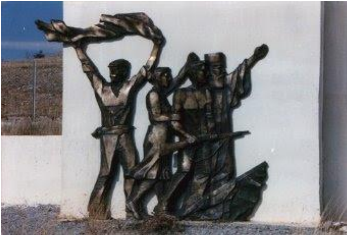
Figure 8 – The monument of Fardykambos

"To those who struggled and in the morning fell for the Fatherland, fighters of the National Resistance during the battle in Fardykabos, Siatistians against the occupying troops in 1943".