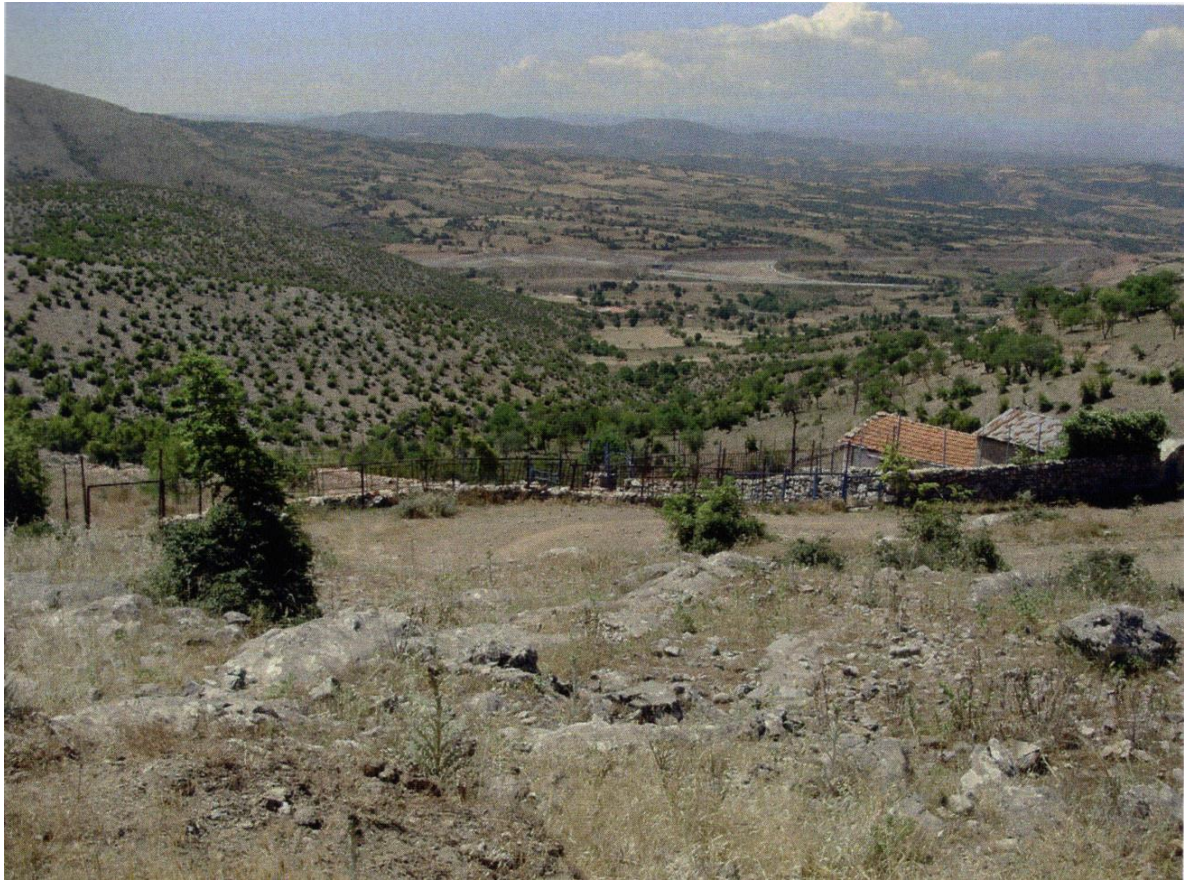
Figure 4 - "Alki's Pit" and, in the background, Fardykambos.

The Italians, having a rich arsenal that the Siatistians did not possess, bombard the Siatistian defensive positions on the aforementioned heights and at the same time fired on the guerrillas with all kinds of weapons (rifles, machine guns, mortars, grenades, and 3 x 75 mm mounted guns). The Siatistians returned fire against the Italians with all the weapons they had, augmented by those acquired after the capture of the Italian company in the ambush of Vigla. The Greek rebels fought with heroism and self-sacrifice, because they knew well that if Siatista was captured, the result would be catastrophic.