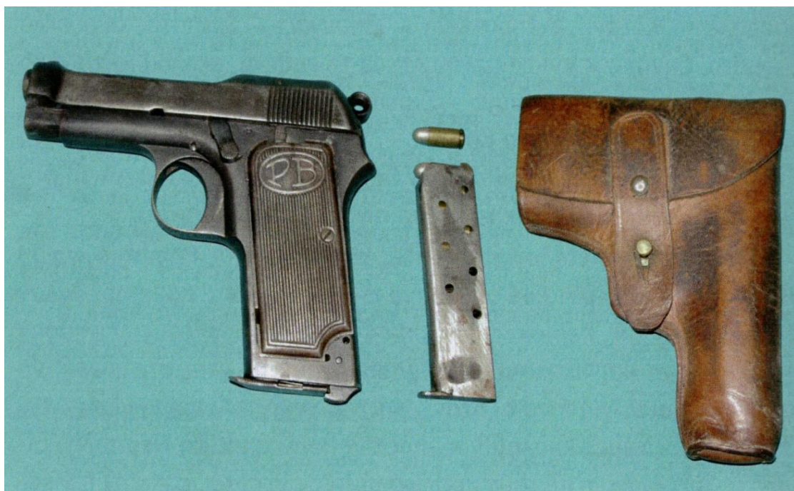
Figure 7 - The pistol of the Italian Major with the holster.