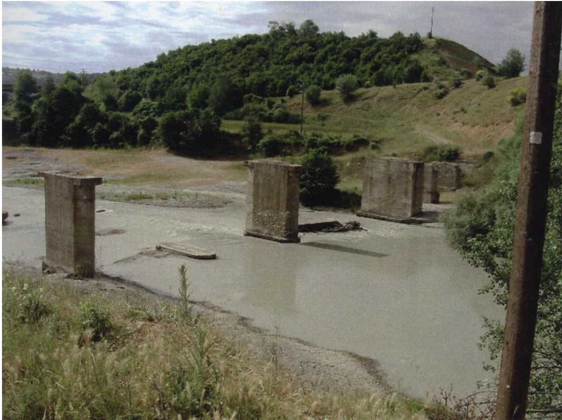
Figure 2 – The remnants of the Aliakmon river bridge (aka “Pasha’s bridge”).

goal had already been achieved, as in Vigla the force of ten Italian cars was in the hands of the Siatistian rebels.