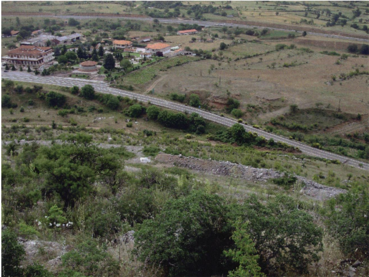
Figure 1 - The point of the road (right after "Bara") where the Vigla ambush was set.