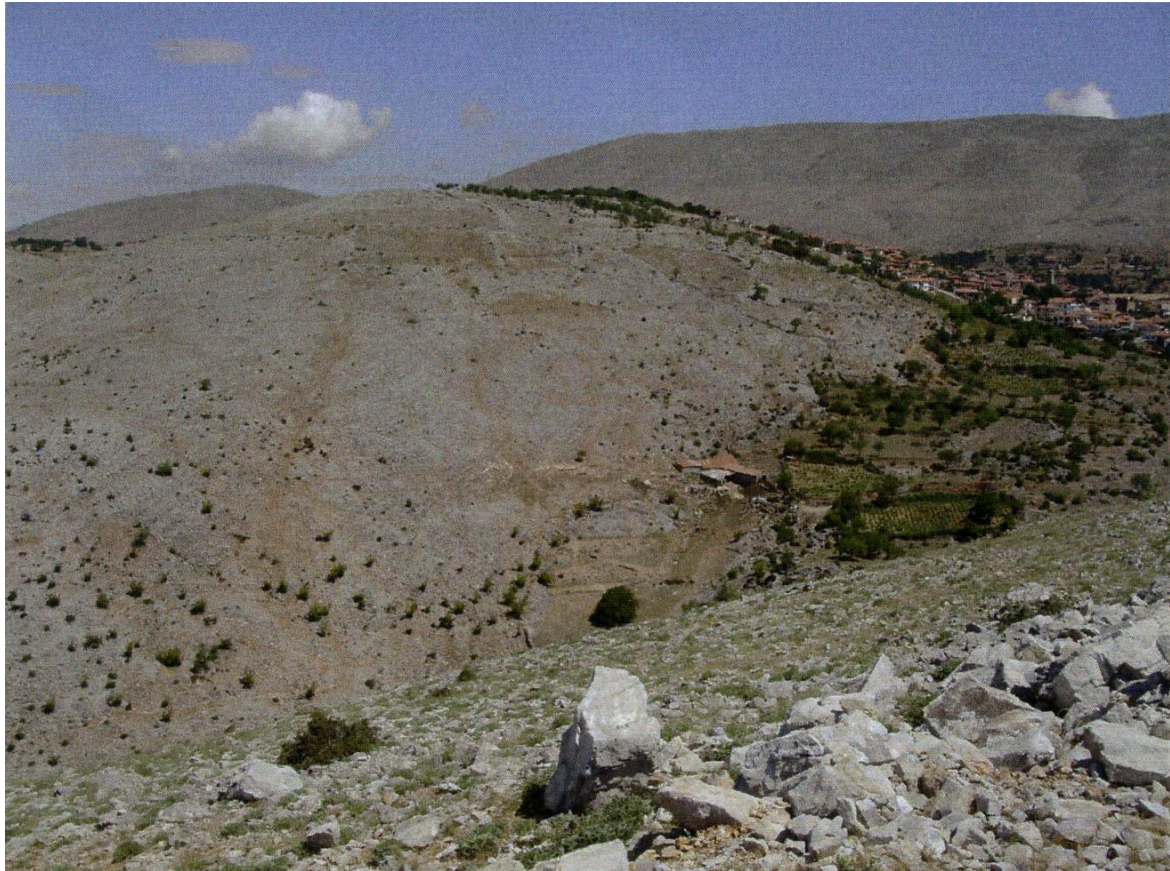
Figure 5 – The ravine followed by the 2 nd Italian company, with the hill of St. Christoforos as its objective