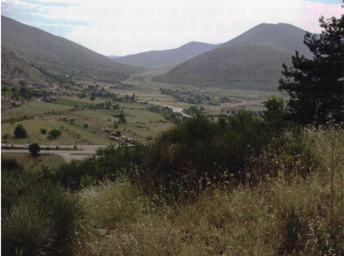
Figure 1 - "Bougazi" and the Kozani – Siatista road, as seen from the hill of Vigla.

The Siatistian guerrillas fought with bravery and tenacity, despite the fact that their armament was significantly inferior to that of the Italians. Little by little, they approach the Italians and created a stranglehold around them. The fierce confrontation continued for a lengthy period and little by little the surrounded Italians began to show obvious signs of fatigue and frustration. Finally, seeing that there was no hope of help from anywhere, they were forced, around 11 o'clock, to surrender.